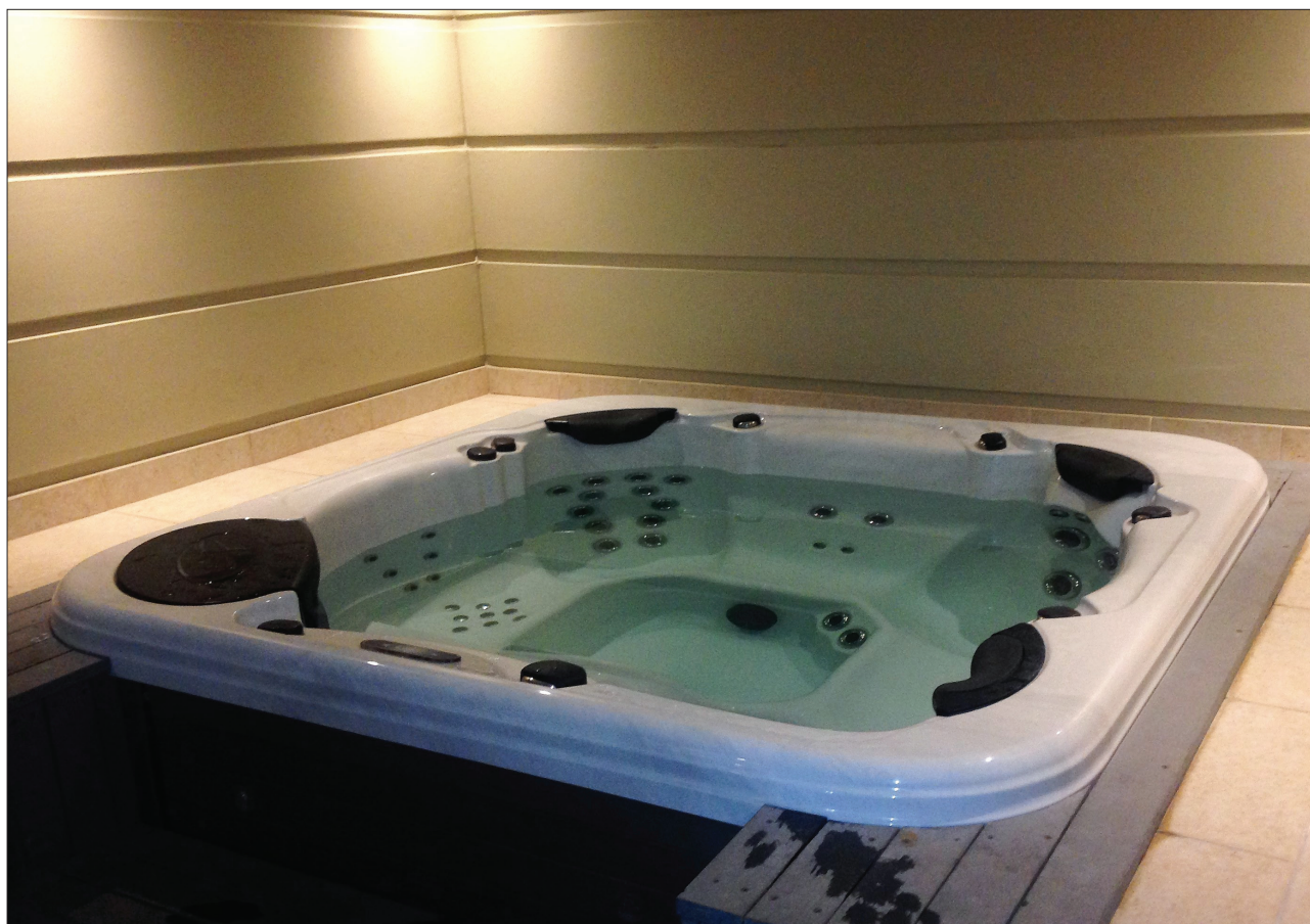
Figure 1: Implicated heated fibreglass spa pool

The building manager was told of the reason for the visit and granted permission for the officers